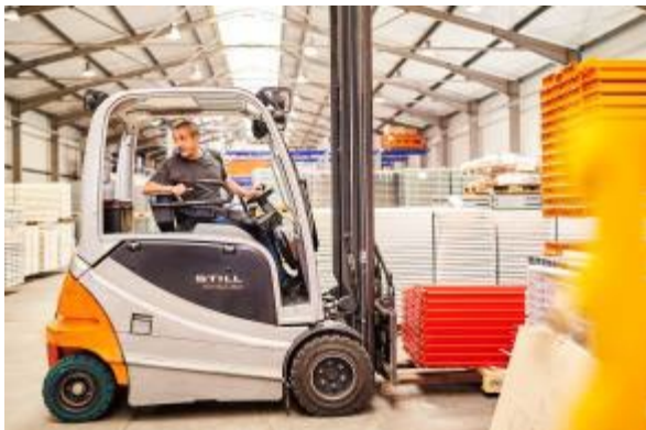
Image ID: Tegometall_Logistik-1.jpg

Caption: The European production locations of Tegometall guarantee short transport routes and delivery times for both small- and large-scale production.