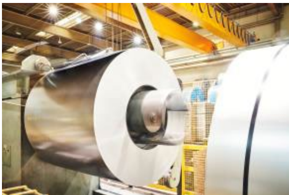
Image ID: Tegometall_Coil.jpg

Caption: Thanks to sustainable production plants and environmentally friendly transportation, Tegometall saves about 9,000 tonnes of CO 2 per year.