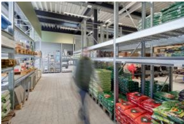
Image ID: Tegometall_Ladenbau_Baumarkt-1.jpg

Caption: For construction material and metalware stores, it is essential to be able present various goods, including large and heavy ones, in an appealing way.