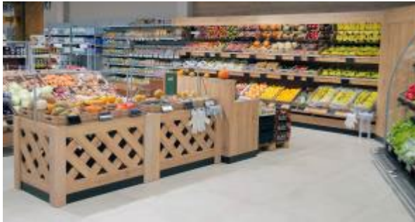
Image ID: Supermarkt.jpg

Caption: Toy shops, chemists, food retailers and kiosks place great value on efficiently stocking their often limited space with as many smaller products as possible.